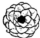
Rose Form Double

(b) Full or Complete Informal Double, usually a convex mass of a mixture of irregular, twisted petals and petaloids, with stamens, if any, obscured. E.g. 'Debutante'.